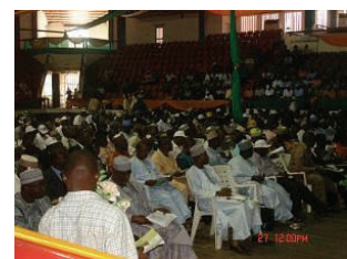
Members waiting for election to start