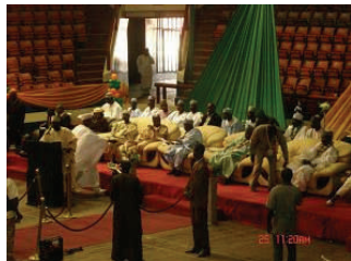
Opening ceremony of 'YANKARI 2008'

Y ankari 2008 took place from the 24th of November to the 28th of November, 2008 at the Multi-Purpose Sports Complex, Bauchi. The theme of this year's conference "Strategies for the Attainment of Vision 20/2020" aims at examining the relevance and the needed contribution of the engineering profession towards the achievement of the Nigeria Vision of becoming one of the world twenty Developed Economy by the Year 2020 (vision 20/2020). Experts from Public and Private sectors of the economy, the academia, policy formulators and the defense subsections from across the country and beyond were brought together to interact and share ideas and experiences on how to achieve the needed economic self-reliance and attainment of vision 20/2020.