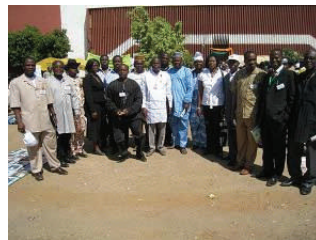
Some NSE PH members in Bauchi