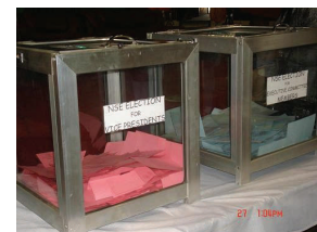
The ballot boxes for VP & EXCO